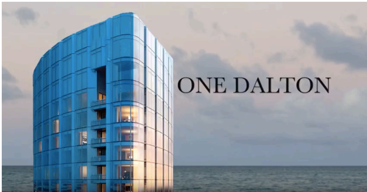
One Dalton Place with rising seas (from Parody video)

Boston is a hub of innovation on climate change and energy efficiency. So when we decided to build New England's tallest and most luxurious residential skyscraper, we consulted the area's top climate researchers for advice. Then, we took our search around the world. We looked at cutting-edge, clean energy technologies. We visited super-efficient skyscrapers in Indonesia and Dubai. And we rejected everything we learned, so we could bring you a masterpiece of conspicuous energy consumption.