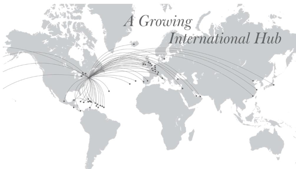
From One Dalton’s Promotional Video touts 50 daily nonstop international flights to Boston

No detail has been overlooked. Concierge services, twenty-four hour doorman, and private elevators to your residence deliver an experience reserved for world’s most discerning clientele. Four Seasons is the most prestigious luxury brand worldwide. And Boston, with over fifty daily nonstop international flights, is now more accessible than ever before. 73