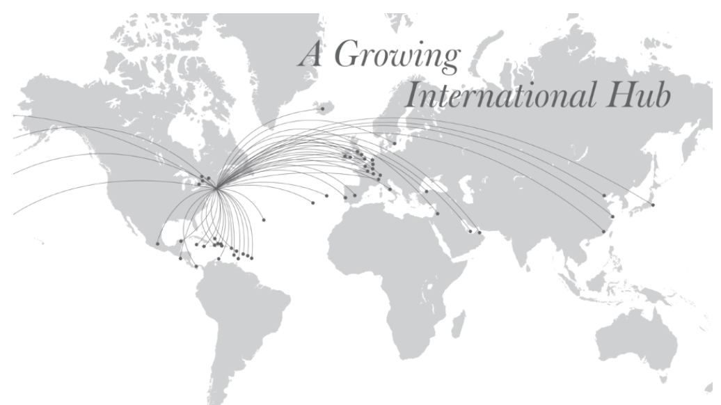
From One Dalton's Promotional Video touts 50 daily nonstop international flights to Boston

No detail has been overlooked. Concierge services, twenty-four hour doorman, and private elevators to your residence deliver an experience reserved for world's most discerning clientele. Four Seasons is the most prestigious luxury brand worldwide. And Boston, with over fifty daily nonstop international flights, is now more accessible than ever before.<sup>73</sup>