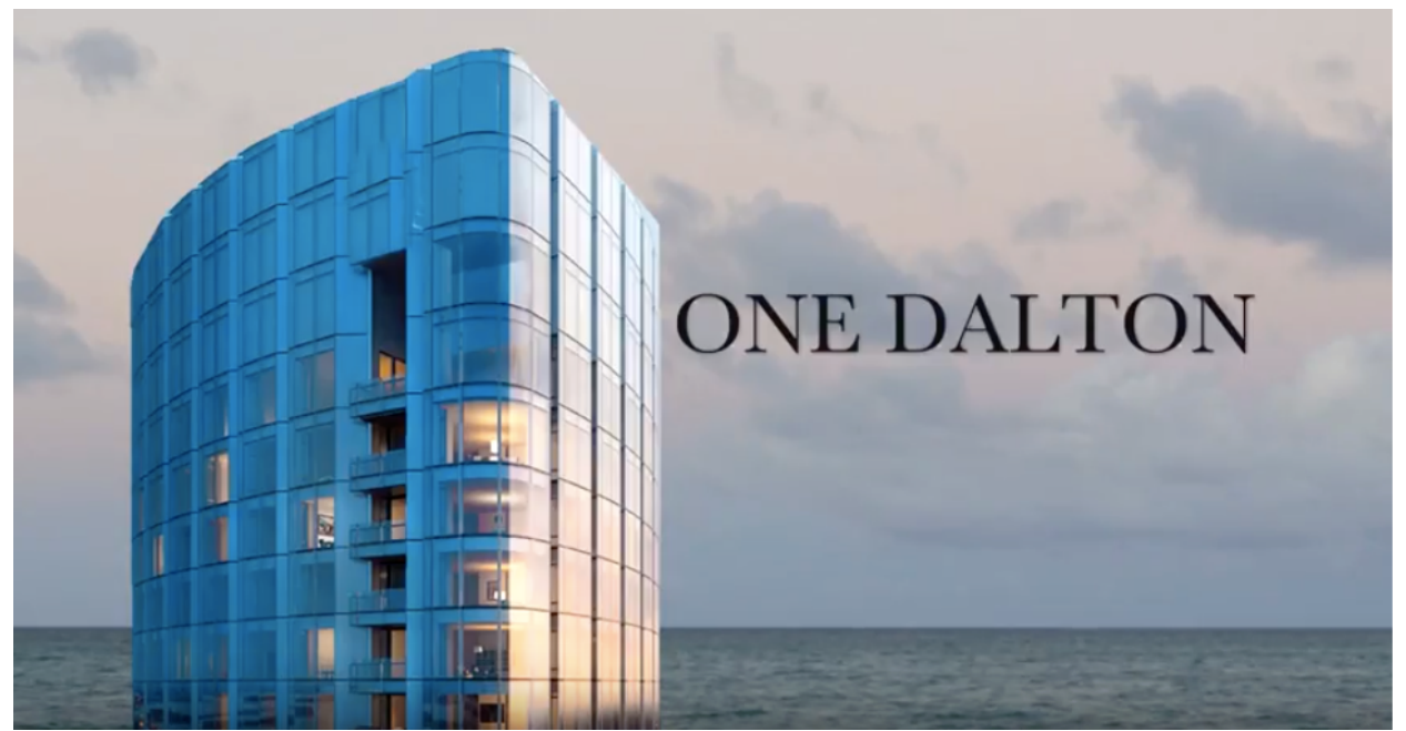
One Dalton Place with rising seas (from Parody video)

Boston is a hub of innovation on climate change and energy efficiency. So when we decided to build New England's tallest and most luxurious residential skyscraper, we consulted the area's top climate researchers for advice. Then, we took our search around the world. We looked at cutting-edge, clean energy technologies. We visited super-efficient skyscrapers in Indonesia and Dubai. And we rejected everything we learned, so we could bring you a masterpiece of conspicuous energy consumption.